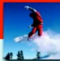
On-Line Event Hosting